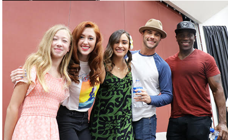
Vista welcomed some of the stars of this season's Tuacahn productions for a fun-filled morning!